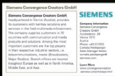
Standard (1/8-Page) Print Listing

Highlight your company with an affordable Industry Directory listing in the Sourcebook—in print and online—for 12 months.