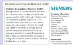
Standard (1/8-Page) Print Listing