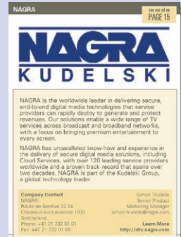
PREMIUM (1/4-Page) Print Listing

STANDARD online directory listing included